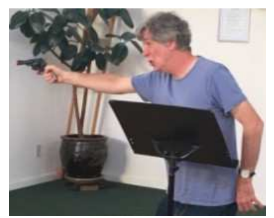
Little Red Riding Hood goes out with a bang.